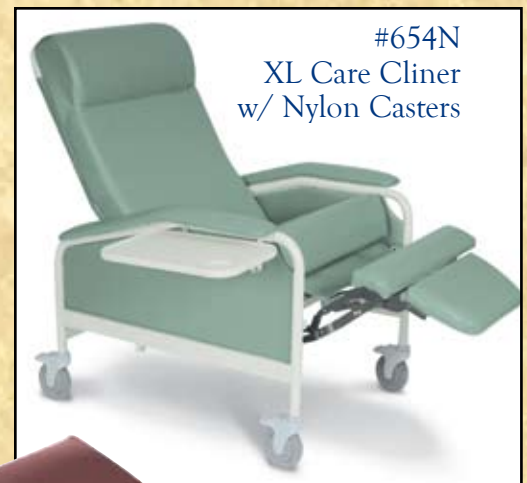
#654N XL Care Cliner w/ Nylon Casters