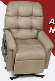
Cirrus Small PR-508S