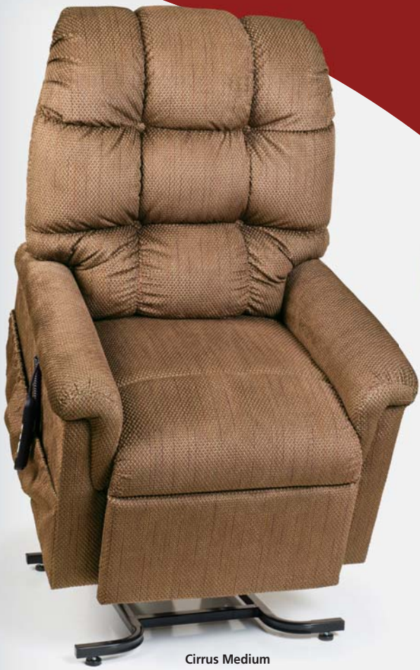
Cirrus Medium PR-508M