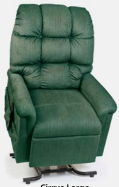
Cirrus Large PR-508L